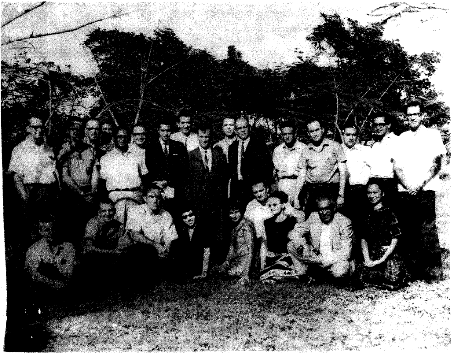
View of some of the participants of the Sixth Meeting of the Association of Island Marine Laboratories of the Caribbean