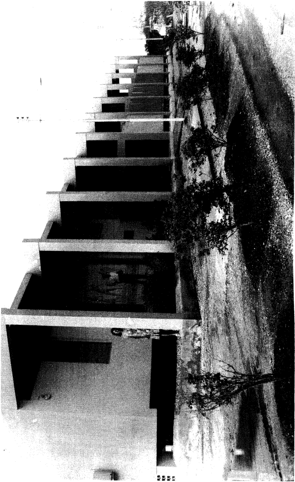
Estación de Investigaciones Marinas de Margarita, Venezuela; site of the Sixth Meeting of the Association of Island Marine Laboratories of the Caribbean.