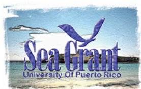
Sea Grant University of Puerto Rico