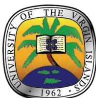
University of the Virgin Islands Center for Marine and Environmental Studies