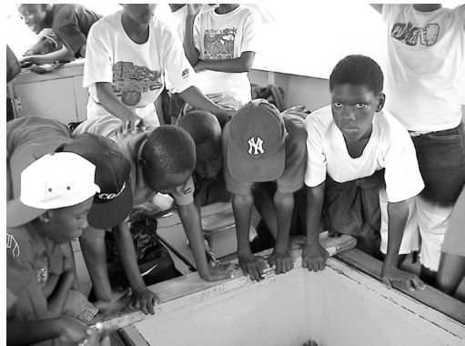
Fig. 2. Students on tour of the Buccoo Reef.

Many teachers expressed the need for this type of project and all lauded the use of