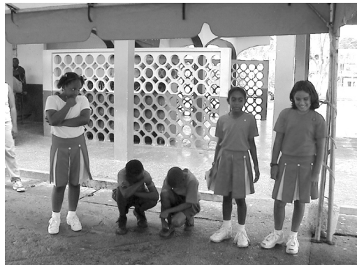
Fig. 3. Students perform a "reef rap".