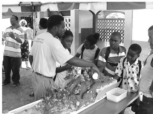
Fig. 4. Buccoo Reef Trust staff illustrating how a coastal model works.

multimedia technology, games, and other interactive activities as effective teaching tools. They recognised the inadequacy of the school curriculum in covering environmental issues and were grateful for a reliable source of