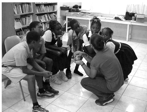
Fig. 5. Students looking at a piece of coral reef in a bottle.

Environmental education is a very important field because it is the process by which individuals receive the information they need to make informed and enriched decisions about