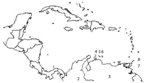
Fig. 1. Southern Caribbean countries: (1) Panamá, (2) Colombia, (3) Venezuela, (4) Aruba, Netherlands Antilles islands of (5) Curaçao and (6) Bonaire, Trinidad and Tobago islands of Trinidad (7) and Tobago (8).

Fishes were obtained from fish markets after having been captured by trawl, traps, trammel nets, spearing, and hook and line. The external surfaces, mouth and gill chambers of