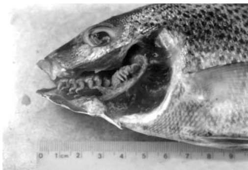
Fig. 6. Lateral view of a female Cymothoa sp. of Bowman and Diaz-Ungria attached to the tongue, and a male attached on top of the left gill rakers, of a Corocoro, Orthopristis ruber (Cuvier) collected at a fish market in Carúpano, Venezuela, 12 July 1999. Left operculum and left side of mouth were excised to expose the attachment positions.

Fig. 6. Vista lateral de una hembra de Cymothoa sp. de Bowman y Diaz-Ungria adherida a la lengua, y de un macho adherido en la parte superior de las branquias de un Corocoro, Orthopristis ruber (Cuvier), recolectado en un mercado de Carúpano, Venezuela, 12 de julio de 1999. El opérculo izquierdo y el lado izquierdo de la boca fueron extirpados para exponer las posiciones de adhesión.