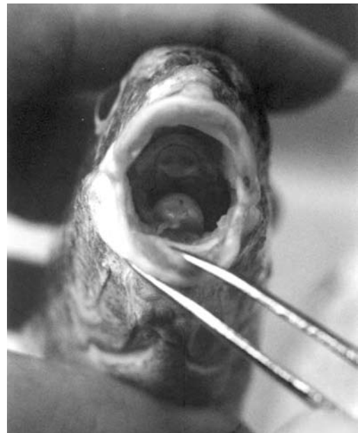
Fig. 5. Anterior view of a female Cymothoa sp. of Bowman and Diaz-Ungria attached to the tongue of a Corocoro, Orthopristis ruber (Cuvier), collected at a fish market in Carúpano, Venezuela, 12 July 1999.

Cymothoa sp. of Bowman and Diaz-Ungria (Figs. 5-6): Bowman and Diaz-Ungria